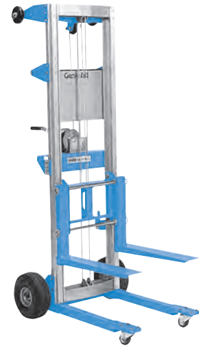
(1) Available aftermarket only