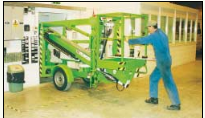
Telescopic axles and compact dimensions allow the Nifty 120T to manoeuvre with ease even in the most restricted areas.