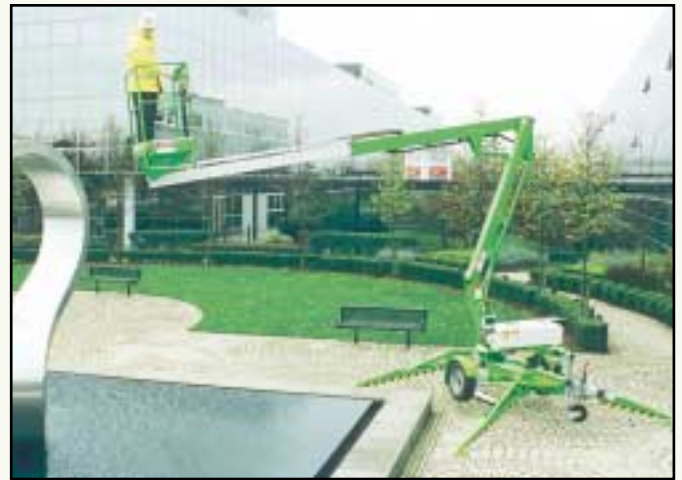
The telescopic boom provides outstanding working outreach especially at lower level where it's needed most.